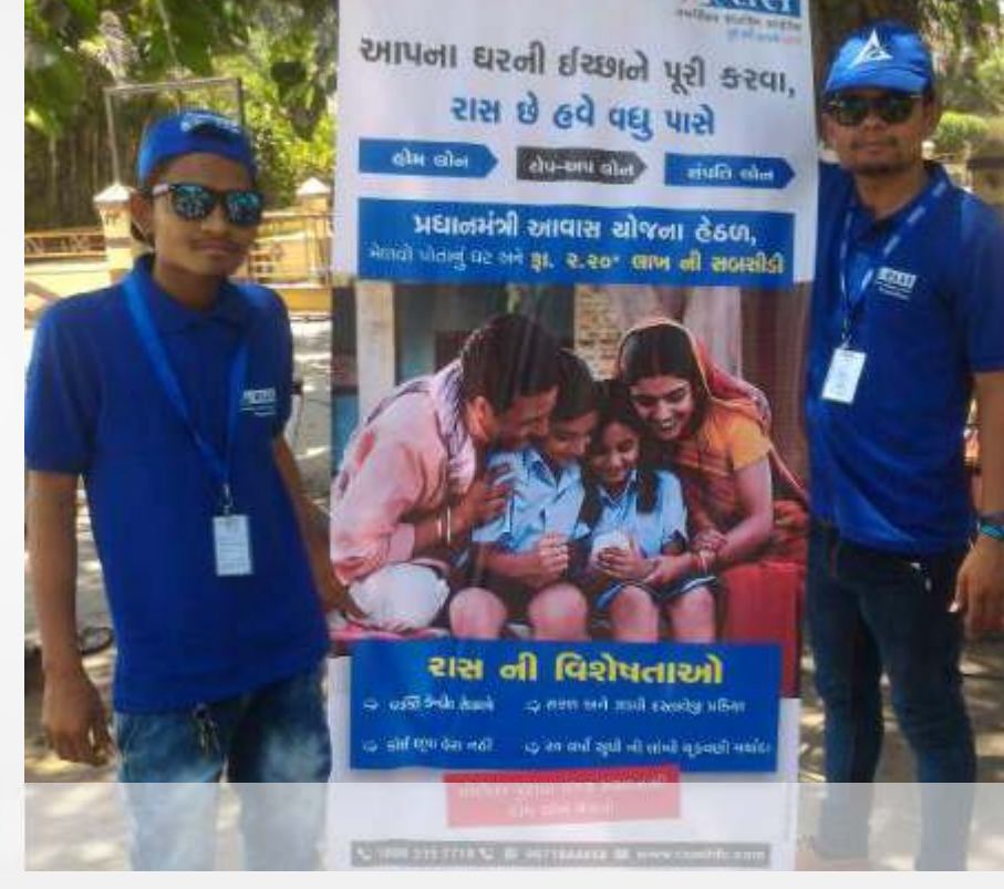
Marketing Activity (L to R): Alwar / Kolhapur / Kota / Mumbai