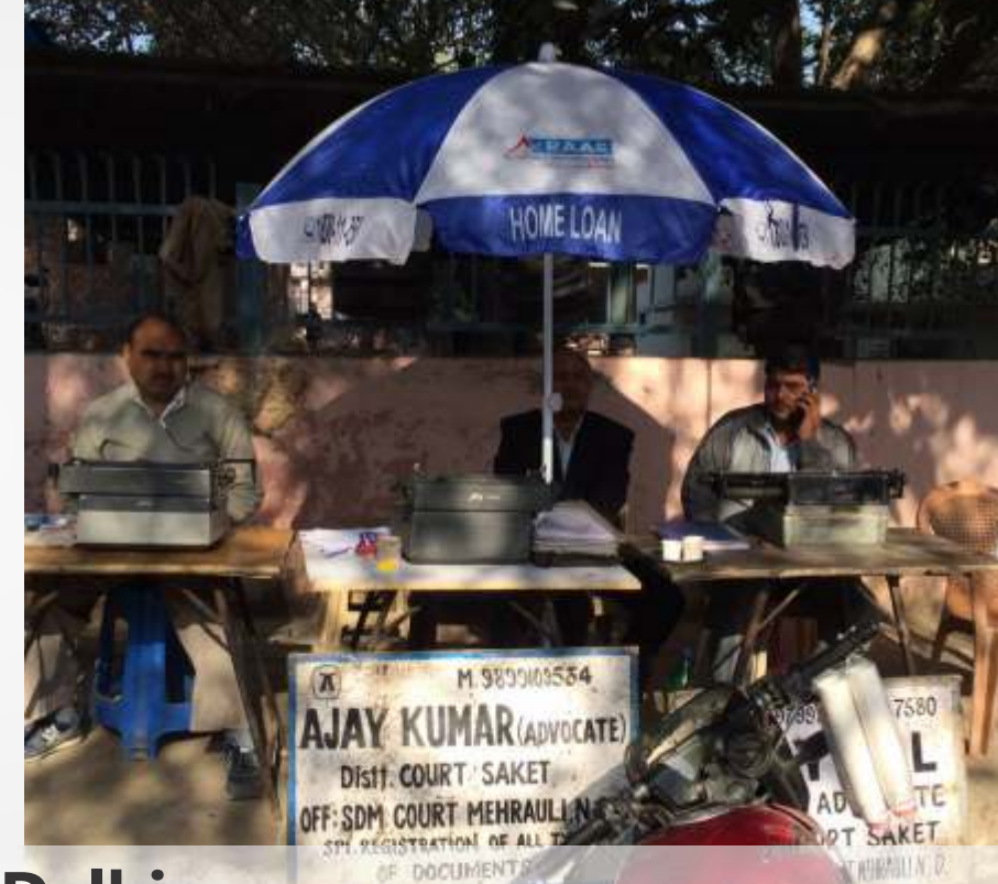
Marketing Activity (L to R): Kaithal / Karnal / Yamuna Nagar / Delhi