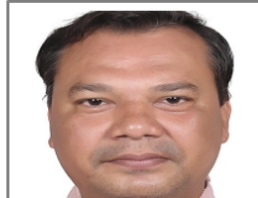
6 years completed

When I joined this organization, I felt like I was part of a family. My Senior & colleagues provided me good guidance, which is the main reason why I am performing well.