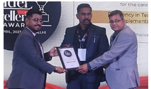
Excellency in Technology Implementation

Another milestone achieved by ART – Winning the prestigious Editor’s Choice award for Excellency in Technology Implementation at NBFC100 Leader of Excellence Awards